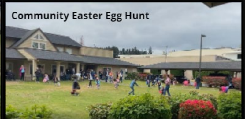
Community Easter Egg Hunt