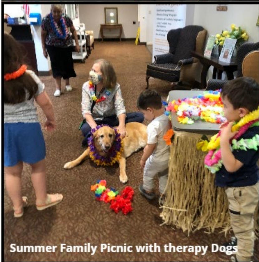
Summer Family Picnic with therapy Dogs