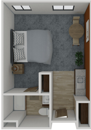
A2 One Bedroom 516 SQ FT