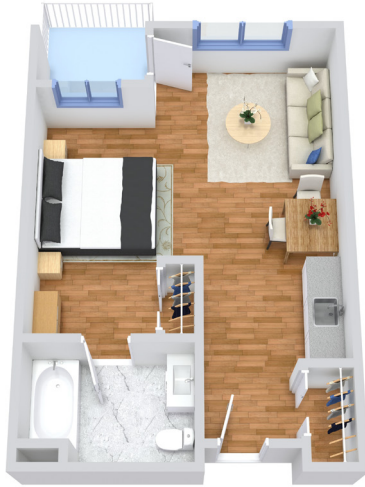
A-1 Studio 444-516 SQ FT

Solstice at Normandy Park offers several floor plan choices to suit your needs.