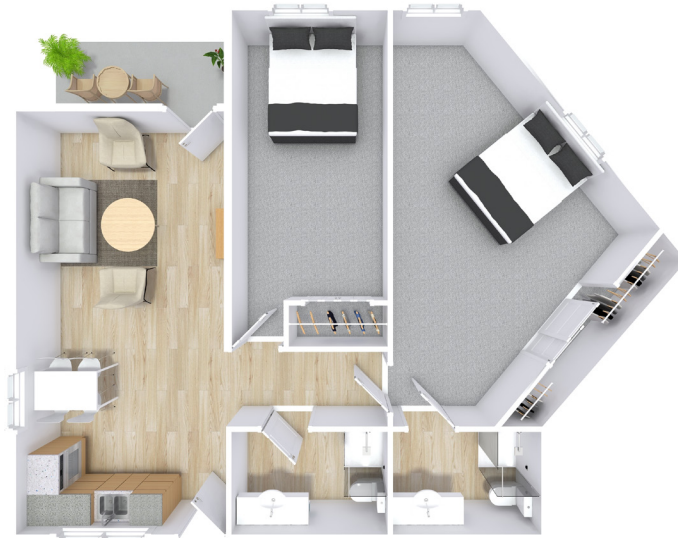
C1 Two Bedroom 875 SQ FT