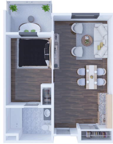
B6 601 SQ FT