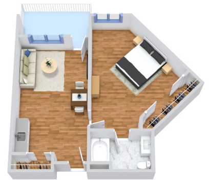
One Bedroom 562 SQ FT

Solstice at Normandy Park 17623 First Avenue South | Normandy Park, WA 98148 844.335.1458 SolsticeAtNormandyPark.com