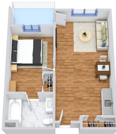
One Bedroom 562 SQ FT