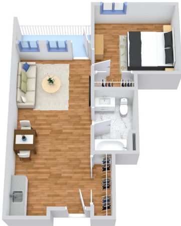
One Bedroom 562 SQ FT