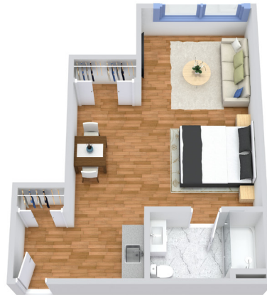
A-2 Studio 444-516 SQ FT